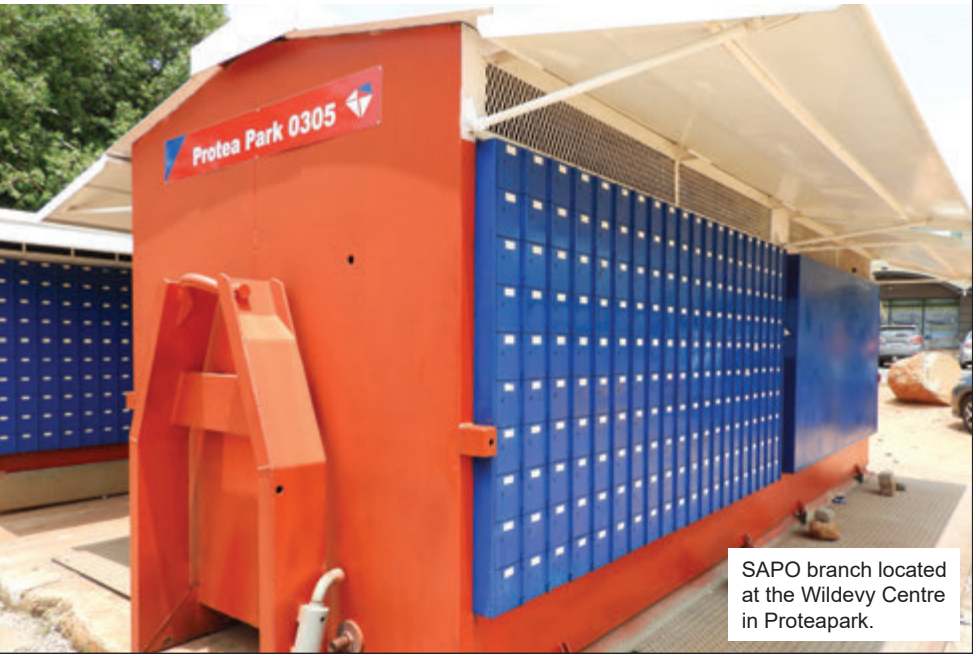
SAPO branch located at the Wildey Centre in Proteapark.

Rustenburg – After the post office branch located at the mall closed its doors, clients have been in the dark about where they can now collect their post. South African Post Office (SAPO) Rustenburg area manager Abel Lebeko confirmed that you can go to your closest post office branch and request them to move your post box there, whereafter you can collect it at the chosen branch. The issue of outstanding post sent to the closed branch is also being attended to and will be resolved in due time.