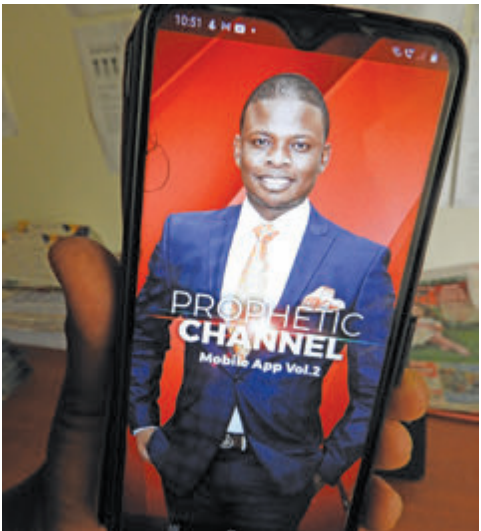
Shepherd Bushiri has launched an application called Major 1 Connect, which will allow followers to subscribe to watch his live and recorded services on a cellphone.