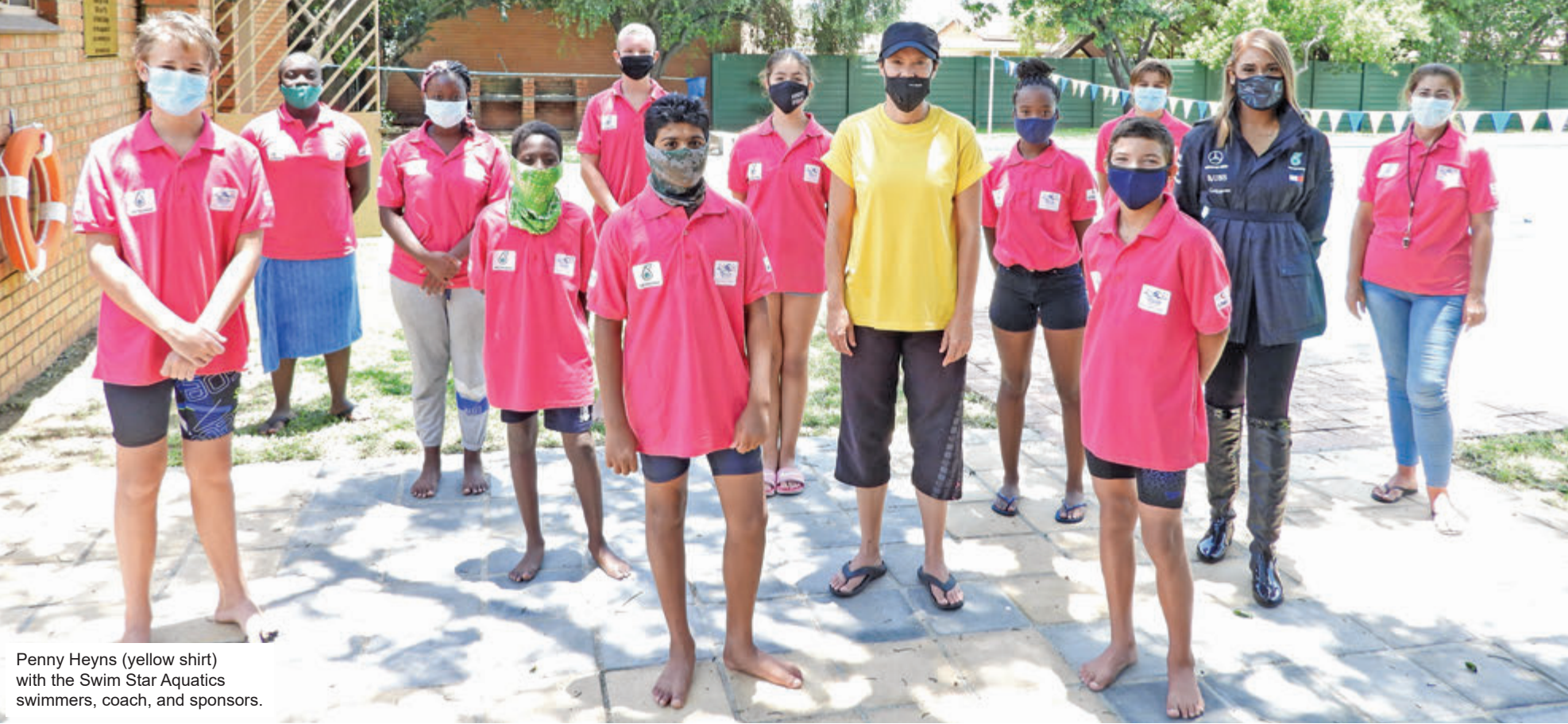
Penny Heyns (yellow shirt) with the Swim Star Aquatics swimmers, coach, and sponsors.

dreams when you are successful. My reason was that someday when I stand in front of my Maker to be able to say that I did the best I could with the talent that I have been given. I think it is important for every person to understand that we are all here for a reason. You have to recognise your talents and make the most of your opportunities. You have to search your soul for your reason and take responsibility because you can’t sit back and wait for someone to encourage you, you have to generate it from within.”